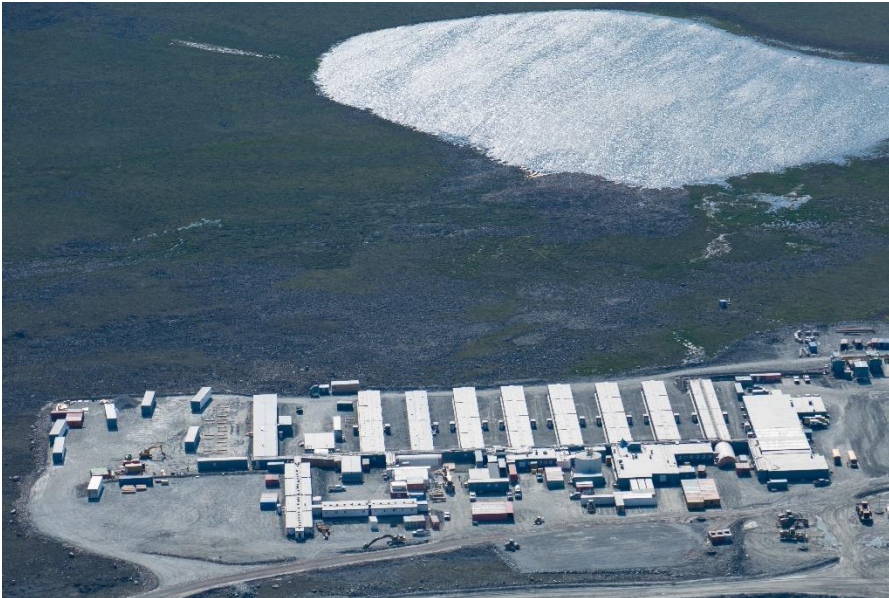
Whale Tail Project, September 2020