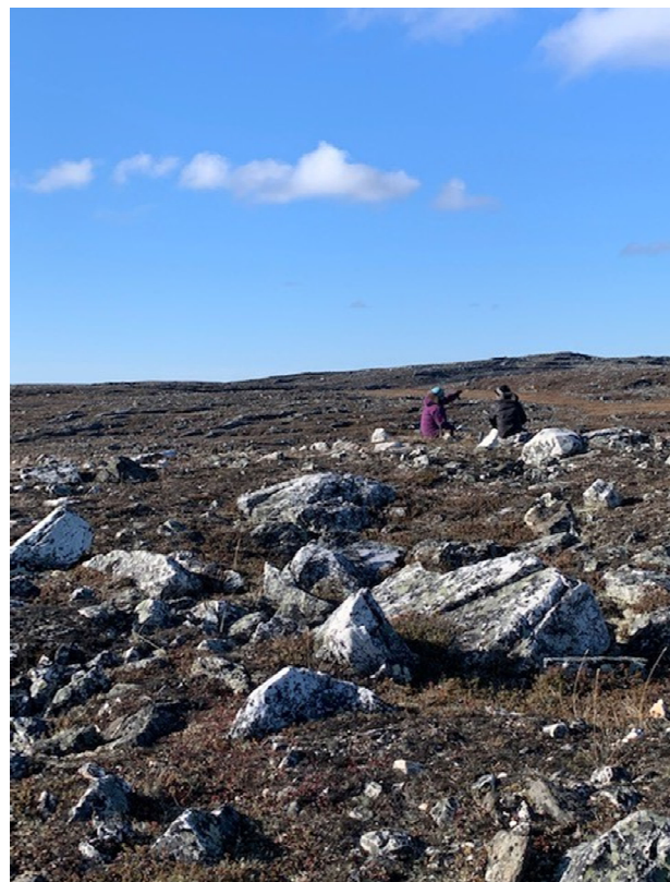
Figure 2 Trip to Upper Amer Lake with Elder Philippa