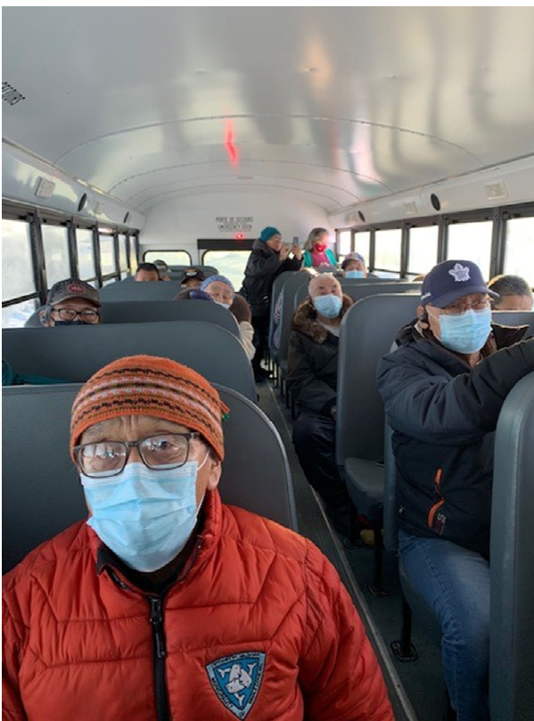
Figure 1 Trip to Meliadine Mine

The follow up second in-person meeting was November November 1-5, 2021. The agenda topics were to review the draft Terms of Reference, honorarium payments, election of committee of Chair and Vice Chair. We also organized a Meliadine site visit with the permission of the Chief Public Health Officer of Nunavut. Finally, our Agnico Eagle adult educator gave an excellent presentation to the Elders on the training opportunities. This presentation was the highlight of the meeting, according to the committee members. As such, the Elders requested that a standard agenda topic at every meeting must include training updates for Inuit.