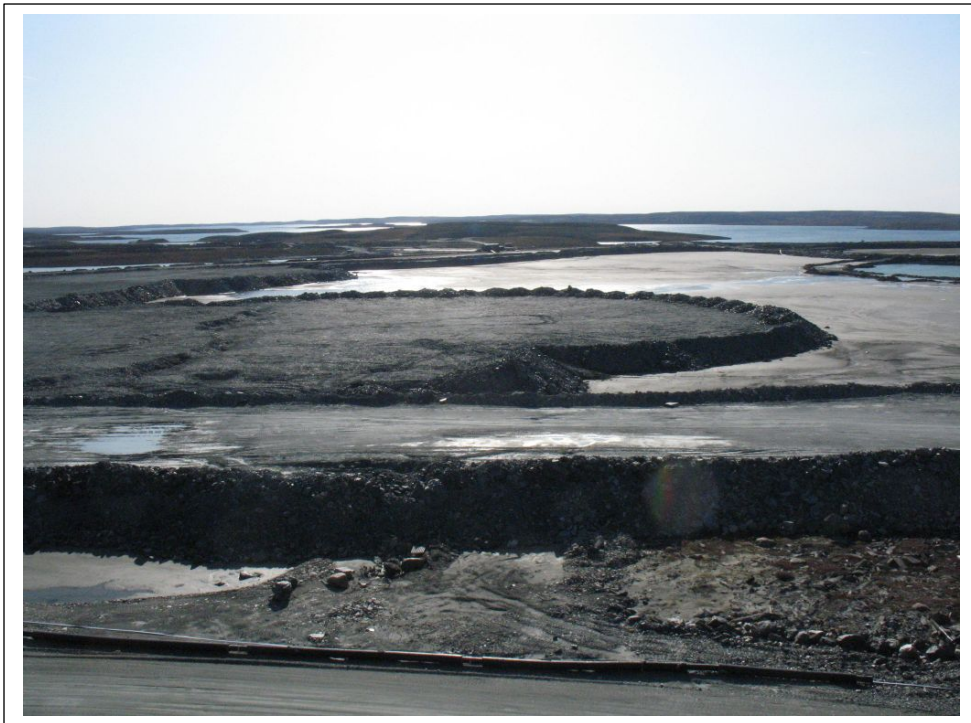
Photo No. 6 Advance of rockfill cover over North Cell of the TSF