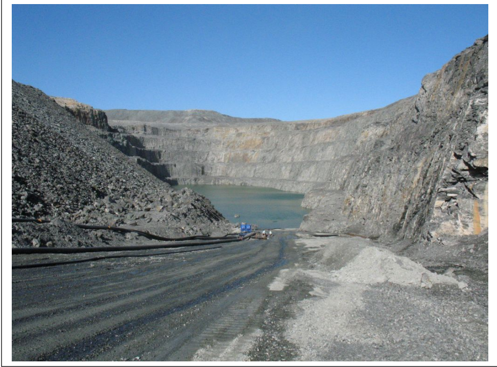
Photo No. 3 Pit A, Settling Pond