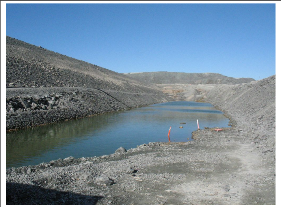
Photo No. 4 Pond at toe of Central Dike