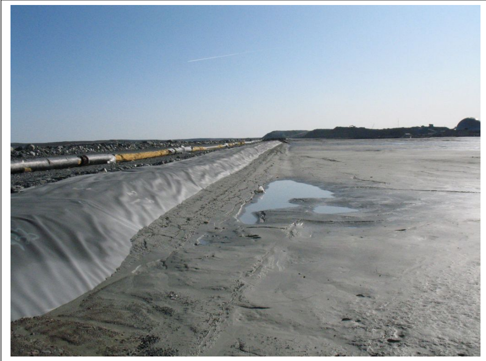
Photo No. 5 Tailings beach against Central Dike