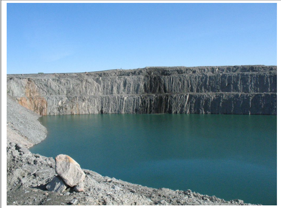
Photo No. 1 Bay-Goose Pit