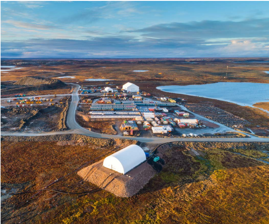
Whale Tail Project, September 2018