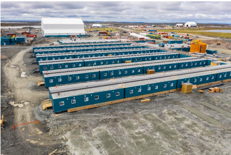
Whale Tail Project, September 2018