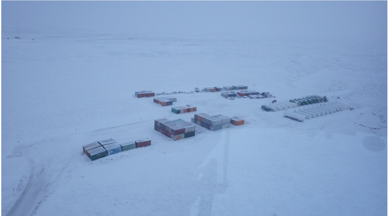
Amaruq fuel farm and sea cans storage, October 2016