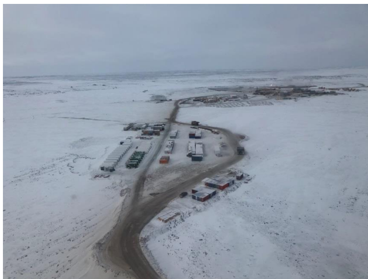
Amaruq fuel storage and camp site, November 2017