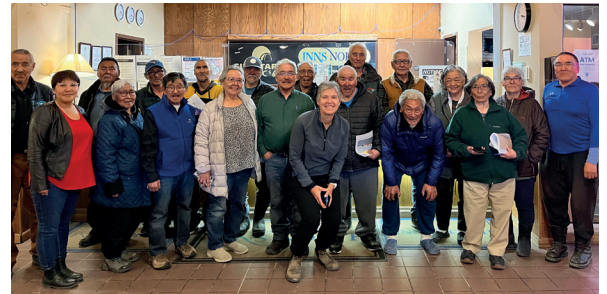
Kivalliq Elders Advisory Committee annual meeting