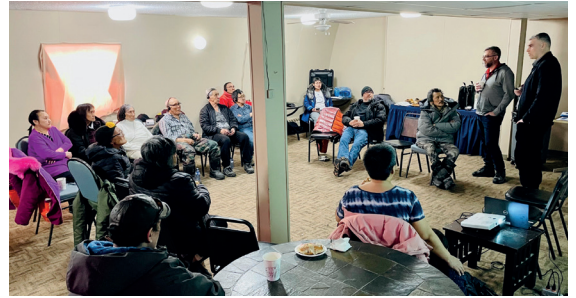
ᓂᓂᓂᓐᐅᓂᓂᓐ ᓂᓂᓂᓐᐅᓂᓂᓐ ᐅᓂᓂᓐᐅᓂᓂᓐ