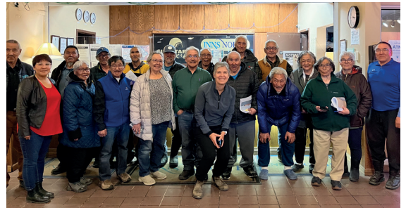
ᓂᓂᓂᓐᐅᓂᓂᓐ ᓄᓄᓄᓐᐅᓂᓂᓐ ᓂᓂᓂᓐᐅᓂᓂᓐ ᐅᓂᓂᓐᐅᓂᓂᓐ ᓂᓂᓂᓐᐅᓂᓂᓐ