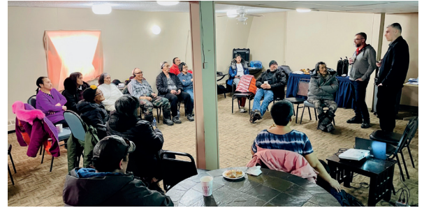
Baker Lake Coffee &amp; Chat