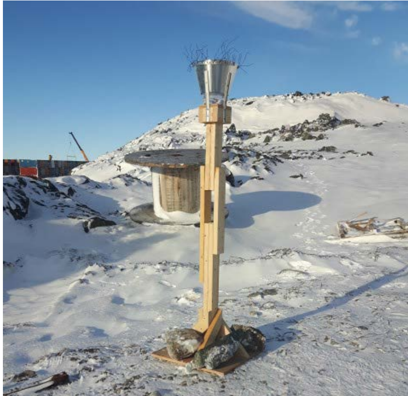
Figure 2-2. Dustfall monitoring station.