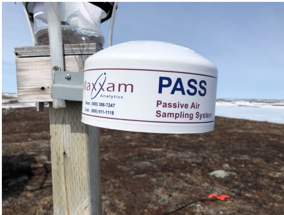
Figure 2-3. NO 2 -SO 2 sampler at the Meliadine site.

Passive NO 2 -SO 2 samplers, provided by a commercial analytical laboratory, are used for this monitoring program. The monitors are suitable for this type of program as they require no electricity, and can be left unattended for extended periods. The samplers are deployed by Agnico Eagle technicians according to laboratory-identified procedures, and mounted to a support pole co-located with dustfall samplers (Figure 2-3). The passive samplers are exposed for a nominal period of 30 days before they are retrieved, replaced, and sent to the laboratory for analysis.