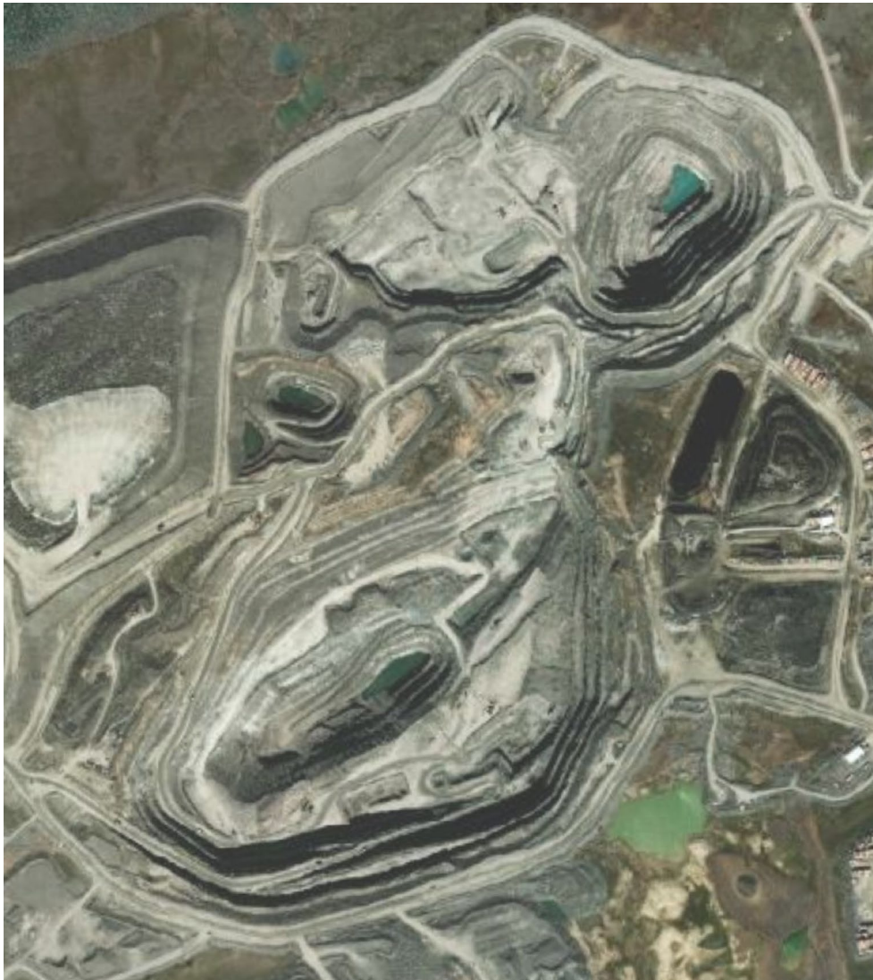
Figure 1-2 Aerial photo of Whale Tail and IVR Pits (Summer 2023)