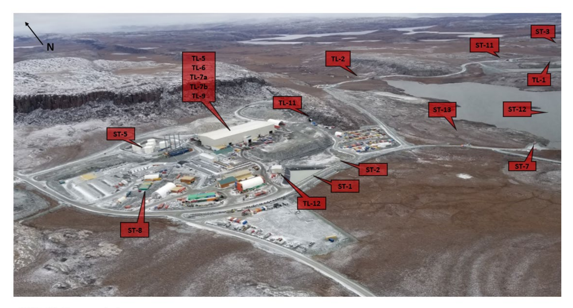
Figure 2a Doris SNP Sample Stations