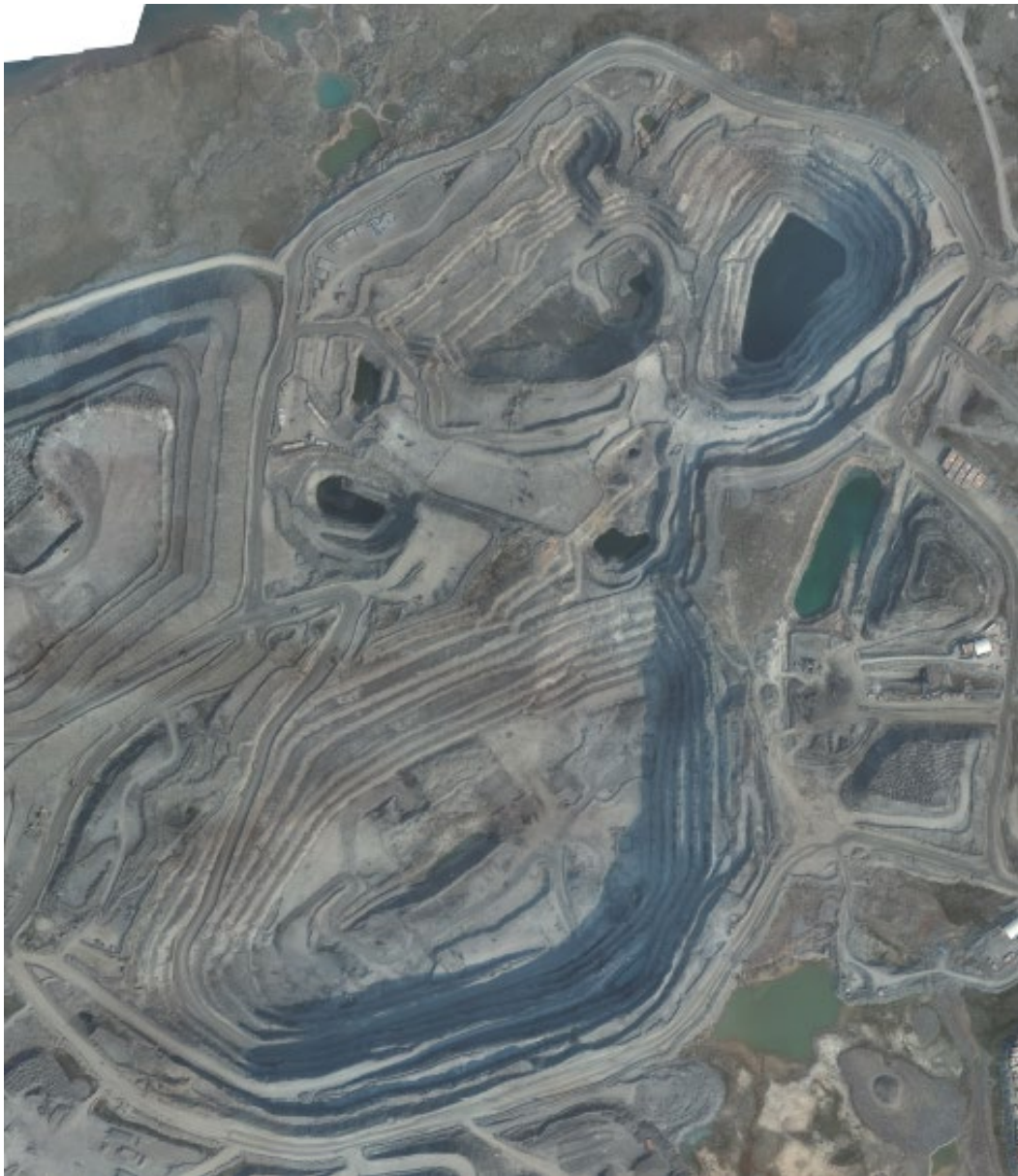
Figure 1-2 Aerial photo of Whale Tail and IVR Pits (Summer 2024)

In 2024, Agnico Eagle Mines Limited's Exploration division has only one fuel storage locations related to the NIRB decision #11EN010. The fuel cache was located at the Meadowbank exploration camp and consist of four (4) tanks with a total capacity of 130,500 liters and drum stored in three (3) seacans for diesel and jet fuel. For the Amaruq exploration activities, fuel was supplied by the mine operations fuel farm. Jet-A fuel is no longer available at Amaruq and is now only supplied by the Meadowbank airport facility.